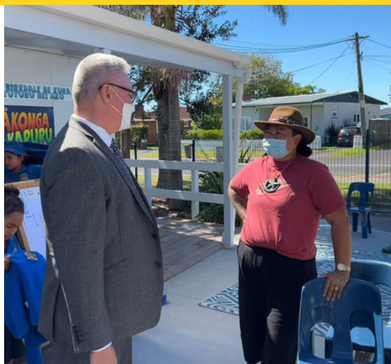
Minister Kelvin Davis visiting