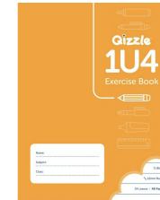
1/3 blank | 2/3 12mm rules