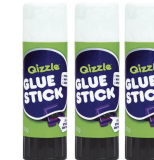
35g - large x3