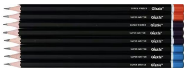
Pencils x 8