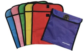
Book bag 280 X 300mm