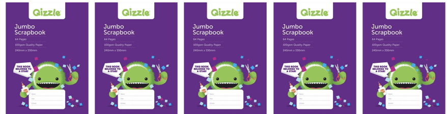
Blank scrapbook: larger than A4, 240 x 330mm