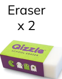
Eraser x 2