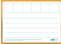
Whiteboard $6 each